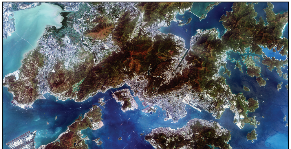
Above: Deliver flawless mosaics in hours - not weeks or days.

GXL delivers a rapid return on investment in a scalable package suitable for any sized operation. Learn more about GXL by visiting www.pcigeomatics.com/GXL today.